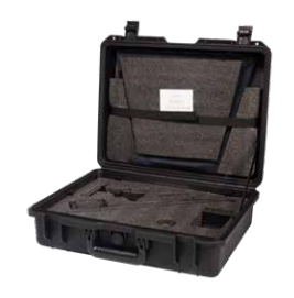
HC-600 Hard Case for TP-600/650 Teleprompter Kit