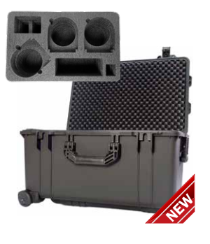
HC-800FS Water, Dust and Crush Resistant Case with foam compatible with PTC-280, PTC-140T and PTC-150TL - Trolley Style (XXL)