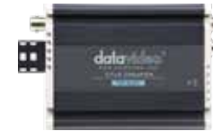
TC-200 SDI Title Creator