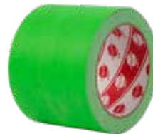
TA-2 Green Color Tape 96mm x 25M