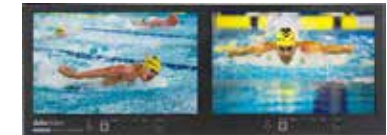
TLM-102 Dual 10" Monitor