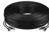
CB-68 70m 2-in-1 Cable