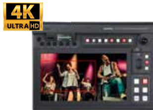
KMU-200 4K Multi-Channel Streaming Switcher