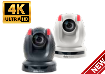
PTC-280 4K Camera