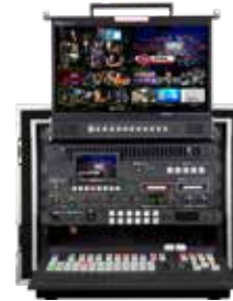
MS-3200 12 Input Flyaway Studio