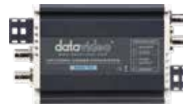
DAC-70 Up Down Cross