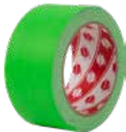
TA-1 Green Color Tape 48mm x 25M