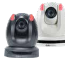
PTC-150 1080P Camera