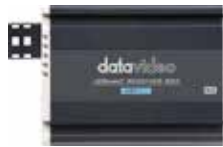
HBT-11 HDBaseT Receiver Box