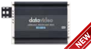
HBT-12 HDBaseT Receiver Box