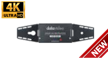
VP-929 4K HDMI Repeater