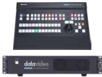
SE-3200 12 Input 1080p60 Switcher