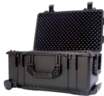
HC-700 Water, Dust and Crush Resistant Case - Trolley Style (XL)