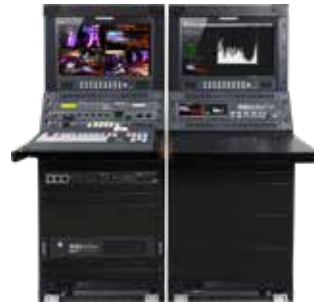
OBV-2850 8 to 12 Input OB Van Studio