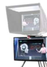
LBK-2 Look Back Kit for Monitor