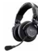
HP-2 Dual-Side Headset