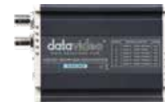
DAC-60 SDI to VGA