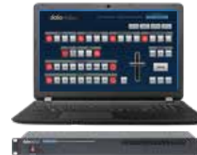
SE-1200MU 6 Input HD Switcher