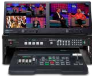
GO 500 Studio 4 Input Mixed Resolution Studio