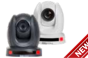
PTC-140NDI NDI PTZ Camera