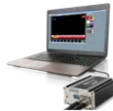
CG-250 HD/SD Character Generator