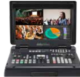
HS-1600T MARK II