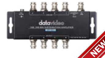
VP-901 SDI Distribution Amplifier