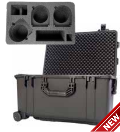
HC-800FS Water, Dust and Crush Resistant Case with foam compatible with PTC-280, PTC-140T and PTC-150TL - Trolley Style (XXL)