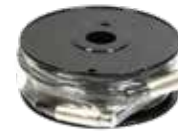
CB-3 20m 5-Pin Intercom Cable