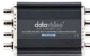
VP-597 2x6 3G-SDI Splitter