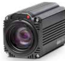
BC-50 1080P Camera with Streaming Encoder