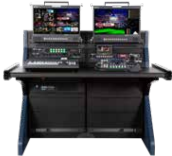
OBV-3200 12 Input HD OB Van Studio