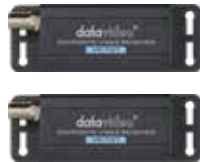
VP-737 Composite Signal Repeater