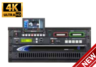
VGB-4000 4K Pro Presentation System