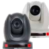
PTC-140T 1080P HDBaseT Camera