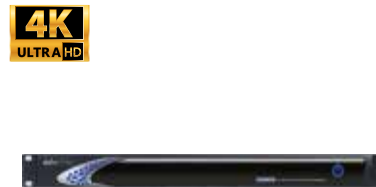
KMU-100 2 Input 4K Virtual Multicamera Processor