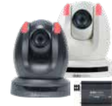
PTC-150T 1080P HDBaseT Camera