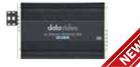
HBT-16 HDBaseT Receiver Box