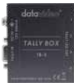
TB-5 Tally Box Converter