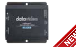
HBT-6 HDBaseT Receiver Box