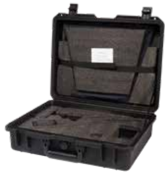
HC-600 Hard Case for TP-600/650 Teleprompter Kit