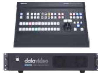
SE-2850 8 to 12 Input 1080p60 Switcher