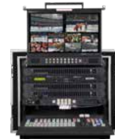
MS-2850 8 to 12 Input Flyaway Studio