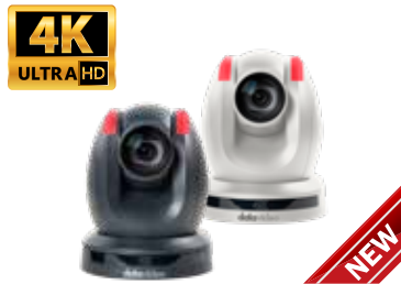
PTC-280NDI NDI 4K Camera