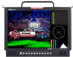
TLM-170V/VM/VR 17" ScopeView Monitor