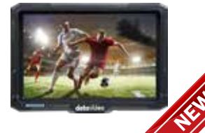
TLM-700UHD 7" 4K Monitor