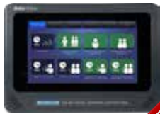
TPC-700 Touch Panel Controller