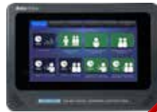
TPC-700P Touch Panel Controller with PoE