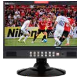
TLM-170L/LM/LR 17.3" HD/SD Monitor