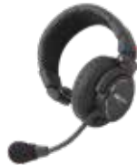
HP-1 Single-Side Headset