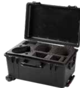
HC-800 Water, Dust and Crush Resistant Case - Trolley Style (XXL)