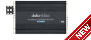
HBT-15 HDBaseT Transmitter Box