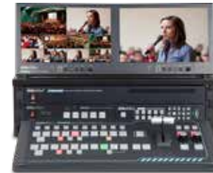
GO 1200 Studio 6 Input HD Studio