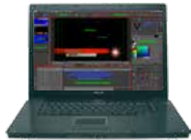
CG-500 HD/SD Graphic & Character Generator