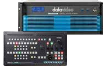
TVS-2000A 3D 2 Input 3G-SDI Tracking & Trackless