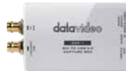
CAP-1 SDI to USB 3.0 Capture Box