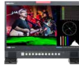
TLM-170K/KM/KR 17" ScopeView Production Monitor