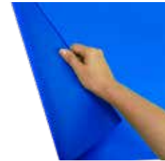
MAT-7 Blue Color Plastic Mat 1.8M x 54M Wall use