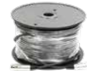
CB-4 50m 5-Pin Intercom Cable