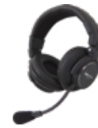
HP-2A Dual-Side Headset with 3.5mm Jack