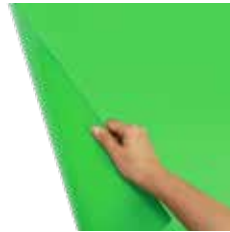
MAT-5 Green Color Plastic Mat 1.8M x 54M Wall use