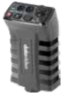
ITC-300SL Digital Intercom Belt Pack