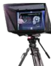
LBK-1 Look Back Kit