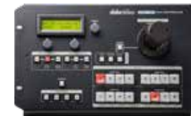
RMC-185 KMU-100 Remote Controller