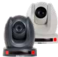
PTC-140 1080P Camera