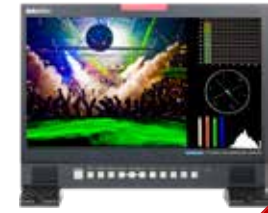
TLM-170F/FM/FR 17" ScopeView Production Monitor