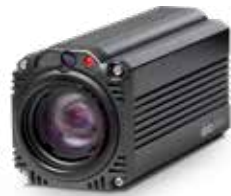
BC-80 1080P Camera