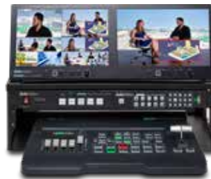
GO 650 Studio 4 Input HD Studio