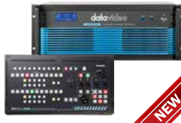
TVS-3000 4K AR 3D Tracking & Trackless