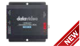
HBT-5 HDBaseT Transmitter Box