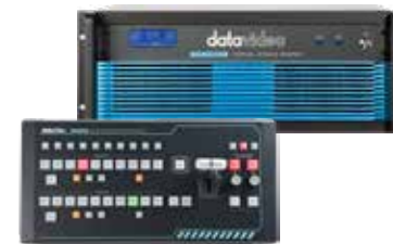
TVS-1000A 2D 1 Input HDMI Trackless